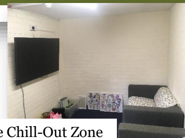
The Chill-Out Zone