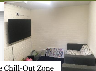
The Chill-Out Zone