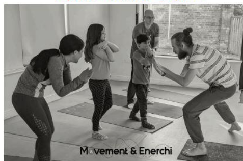
Movement & Enerchi