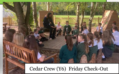
Cedar Crew (Y6) Friday Check-Out