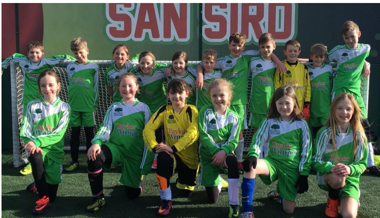
'A Love for Learning'